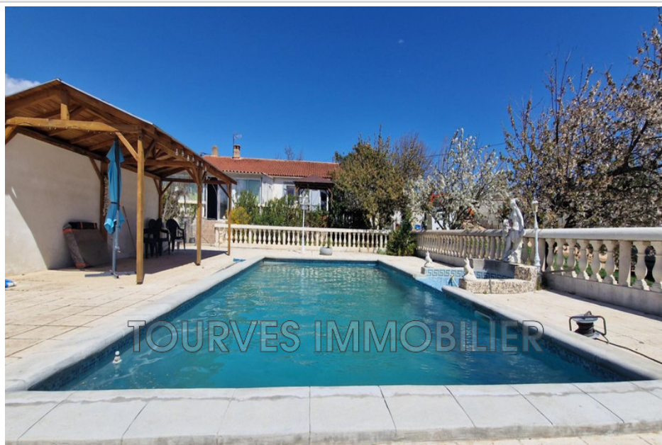
Villa 2171 Saint-Maximin-la-Sainte-Baume